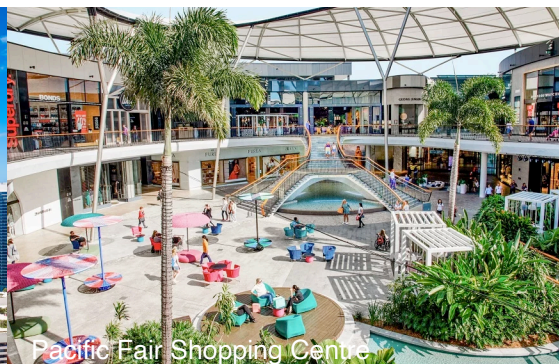
Pacific Fair Shopping Centre